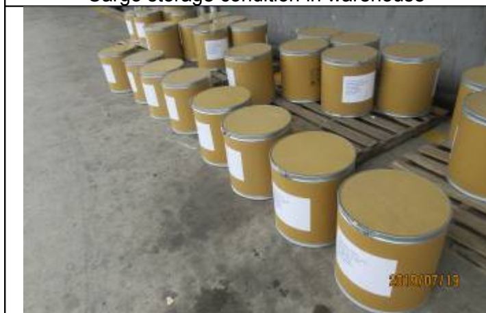
Randomly selected sampled drums