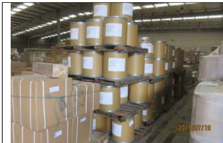
Cargo storage condition in warehouse