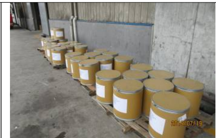
Moving the cargo for sampling